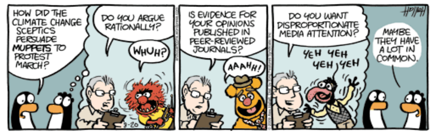
Arctic Circle comic by Alex Hallatt (http://arcticcartoons.wordpress.com)