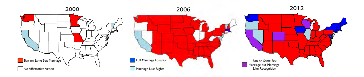
Figure 1. The maps above illustrate the development of same-sex marriage rights in three different time periods: 2000, 2006 and 2012. By 2000, few states, including Washington, had taken affirmative actions on the issue of same-sex marriage. Six years later, most states in the nation had acted on marriage equality. The majority had passed legislation or constitutional amendment to prohibit same-sex marriage as part of an electoral strategy to mobilize conservative voters during the 2004 and 2006 elections. Lastly, by 2012, while most states still have prohibitions, many have tried to accomodate same-sex couples with domestic partnership and civil unions and many others have passed full marriage equality laws.

ples. By the beginning of 2013, nearly a quarter of the population of the United States lived in a jurisdiction that recognizes same-sex relationships as marriages or their functional equivalent (Geidner, 2012).