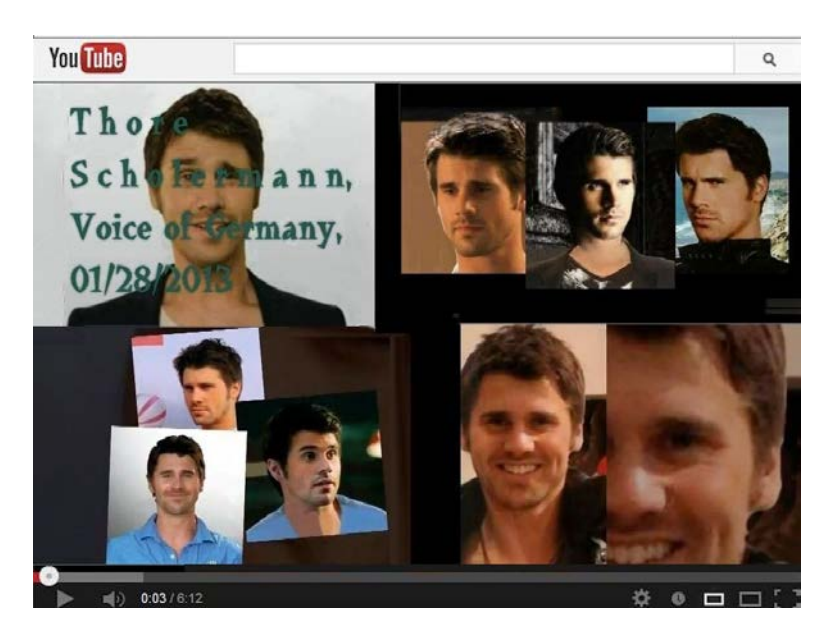
Figure One A YouTube Slideshow about the Actor Thore Schölermann

are narrative as they present personality development. Keyword searches on YouTube locates these videos. When accessors watch these videos, they leave data about themselves and their access of the videos. YouTube access data, so gathered, is an important data source upon which the conclusions reached in this paper are based.