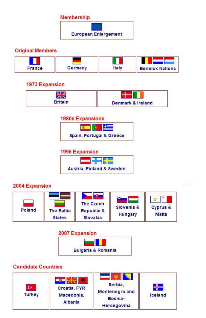
Figure One European Enlargement