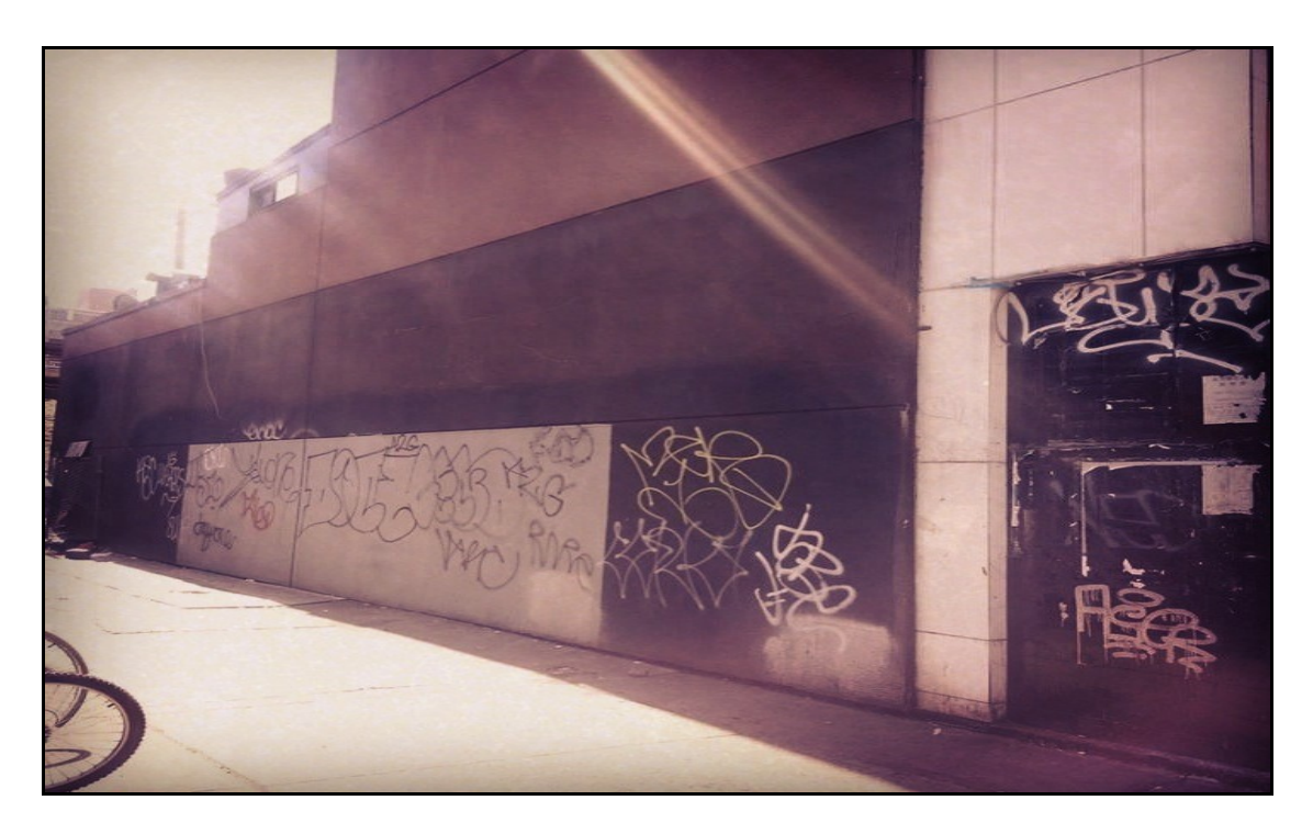
Flushing LIRR Train Station Before (2013)