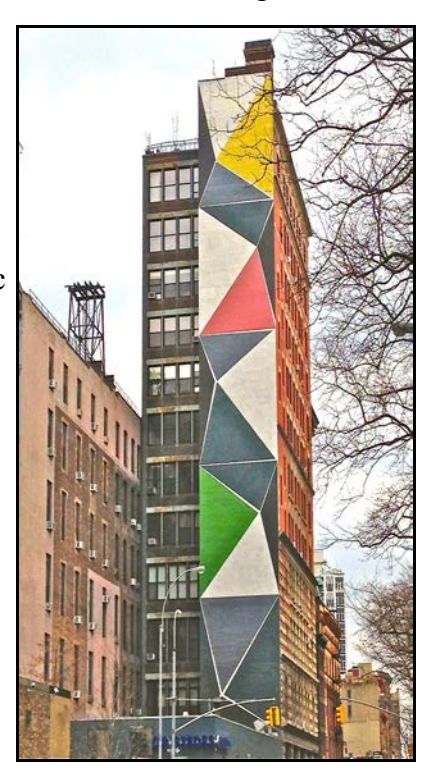
City Wall Inc, 1970.

In contrast to environmental wall paintings, community-based murals are organized in the tradition of the Wall of Respect which