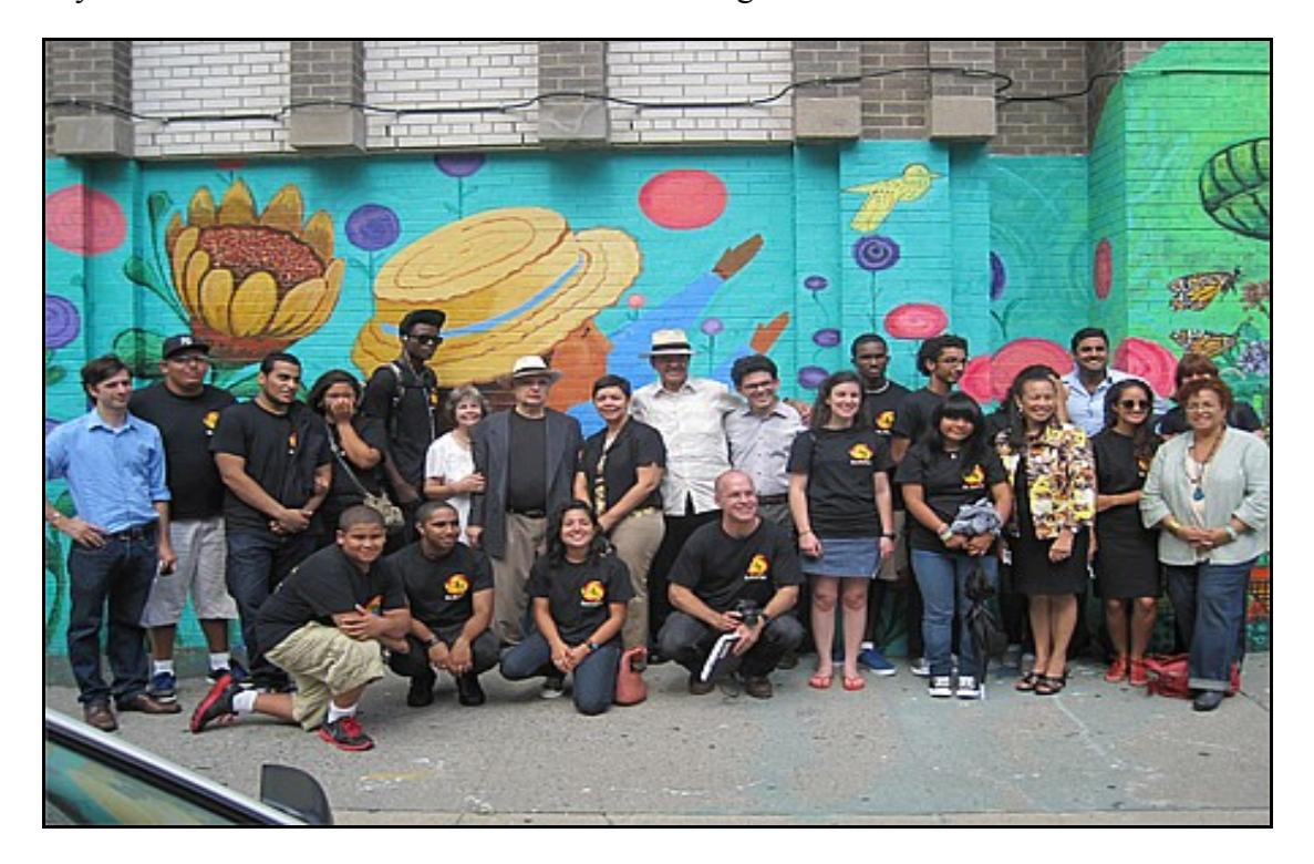
Los Muralistas de El Puente and P.S. 84, "Nurture Nature," (2012).