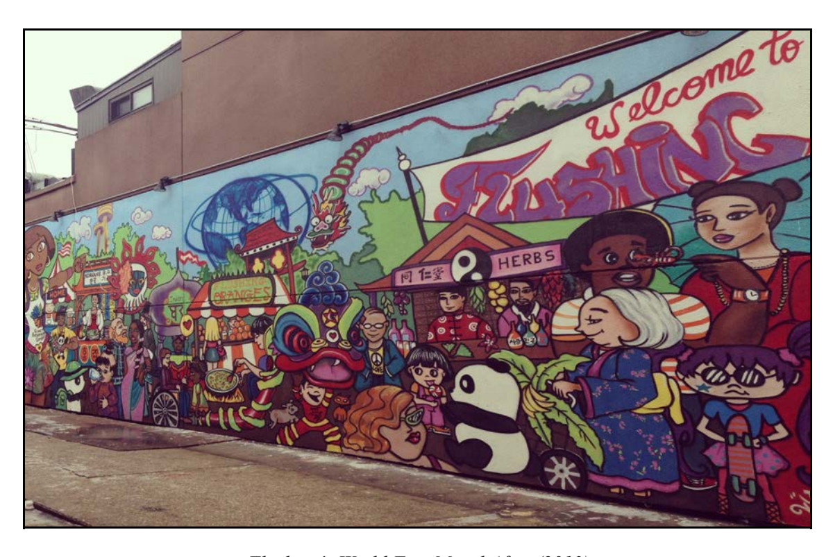
Flushing's World Fair Mural After (2013)