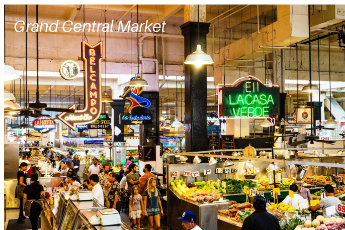
Grand Central Market