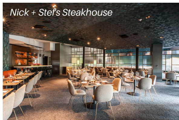
Nick + Stef's Steakhouse