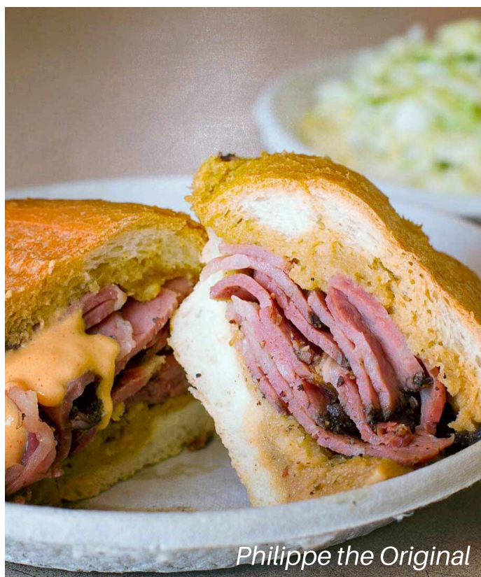
Philippe the Original